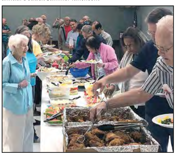
Retirees fill their plates in the buffet line.