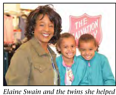
shop were all smiles at the Salvation Army school shopping.

Left: 751 Volunteers on the finished Puyallup ramp built for the brother of a member.