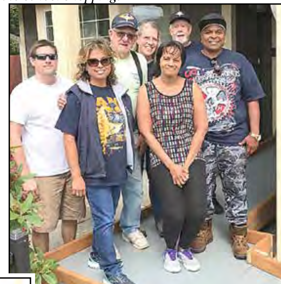
student with Salvation Army back to school