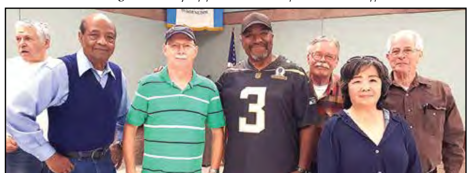
All smiles at the Retirement Club Potluck event on August 12.