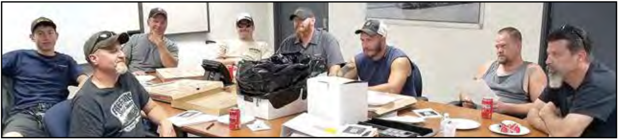
Members at Penske discuss issues at one of three meetings in August after overwhelmingly approving strike sanction – sending a strong message to the employer they are united in efforts to obtain a fair contract.