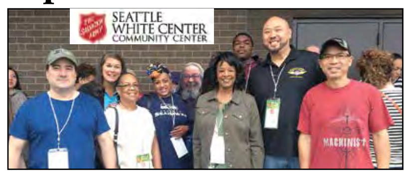
Some of the 751 volunteers helping out with the White Center Salvation Army back to school shopping